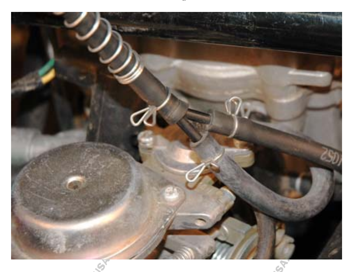
NOTE: Sometimes, the factory will plug the Y-connector into the Carburetor drain hose for shipment. If this is the case, disconnect the Y-connector, and then insert the Y-connector into the fuel tank's vacuum line.

Connect the Fuel Valve's vacuum line to the engines vacuum Y-connector as shown below: