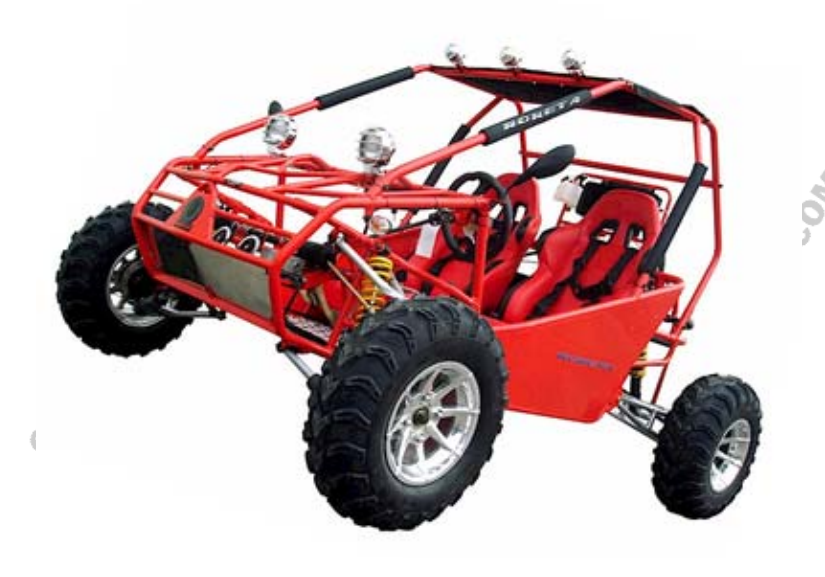
GokartsUSA is a Nationwide Supplier of Powersports Products

It is strongly recommended that setup of your Buggy be performed by a Qualified Mechanic